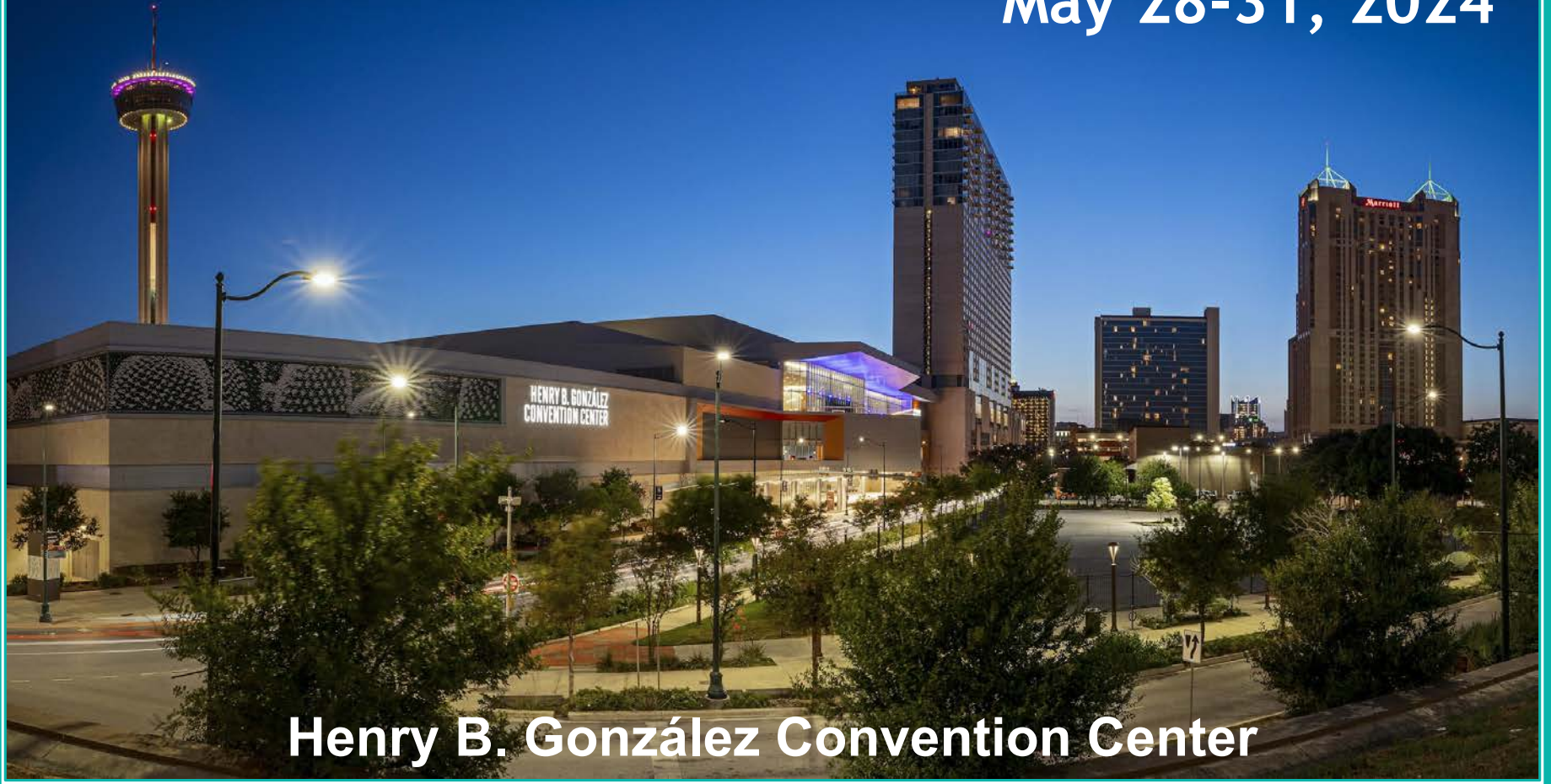
Henry B. González Convention Center