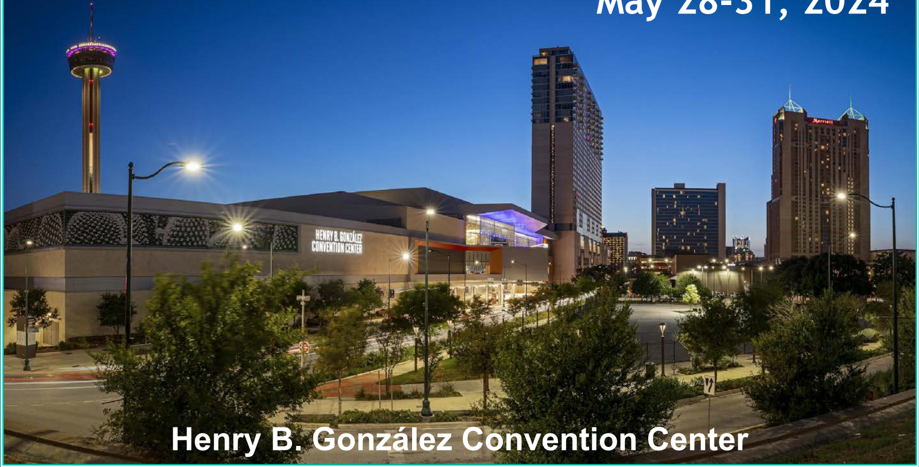
Henry B. González Convention Center